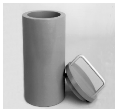
Auxiliary Shield: Item #5420-2116