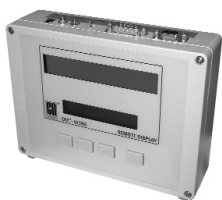
CRC ® -25 Remote Display: Item #5130-2224