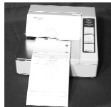
Epson Ticket Printer: Item #5430-0100