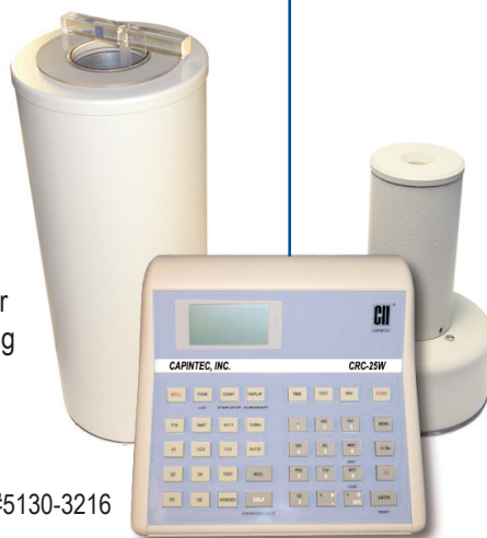
CRC-25W Dose Calibrator: Item #5130-3216

Count on Capintec not only for excellence in energy measurement, but for our unsurpassed customer service, training and support!