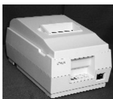
Epson Roll Printer: Item #5430-0058