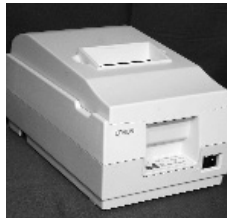
Epson Roll Printer: Item #5430-0058