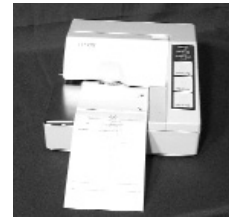
Epson Ticket Printer: Item #5430-0100