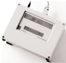
CRC-AD25 Auxiliary Display: Item #5130-2224